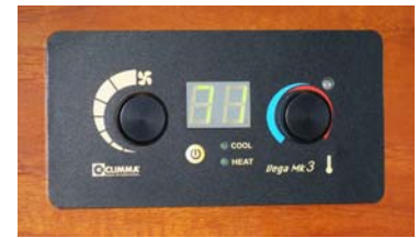
Climma Vega MK III Control

A marine 12v DC air conditioning will have a basic and rudimentary control, whereas a Climma 110v AC model will share a control used by other systems in the Climma range, even by big yachts with chiller systems. This is a dedicated marine control that will give all the benefits of precise temperature control, humidity control, electronic fan speed control, etc.